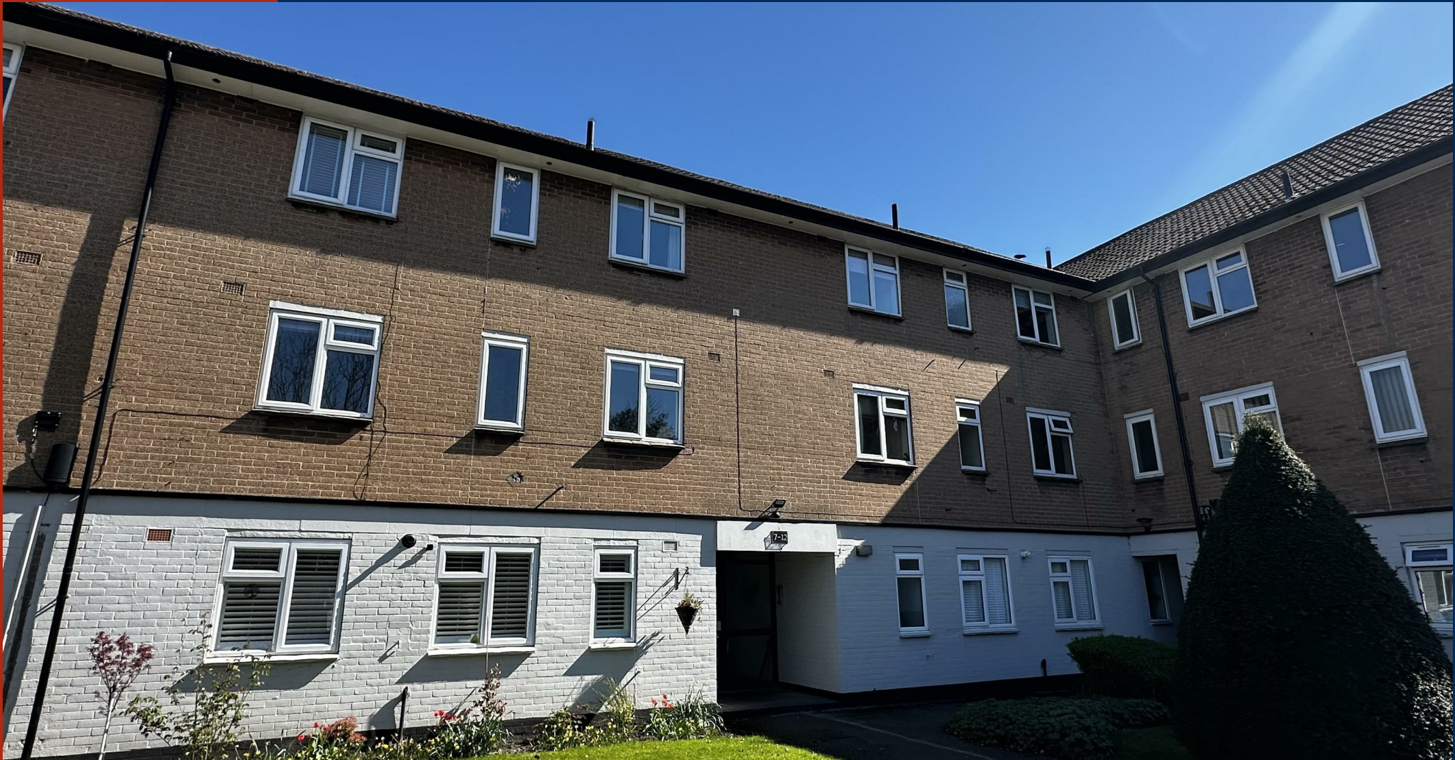
Flat 7 Abbots Court, Sale, M33 2DB